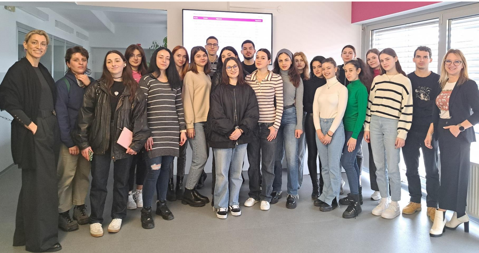
Erasmus Spring generation 2024.