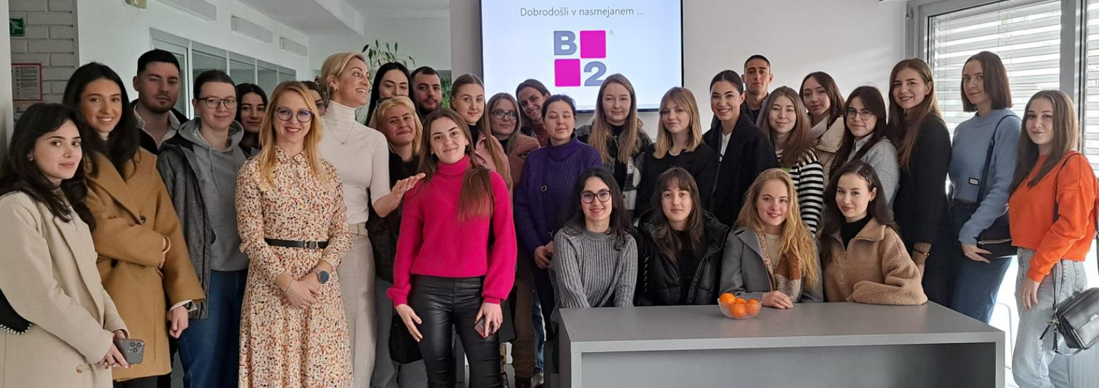
Erasmus Spring generation 2023.